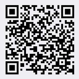
For more specific options, scan this QR code.

All Weather at Home Toll free: 800.638.5709 allweatherathome.ca